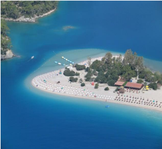
Oludeniz (Blue Lagoon)