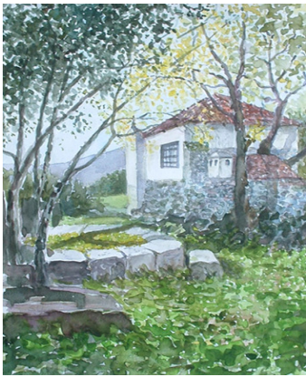
A Painting from Kayakoy