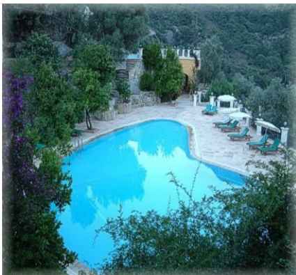
Paradise Garden Hotel