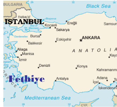
Map of West of Turkey Dalaman Airport –Fethiye 1 hr drive